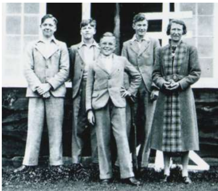
18th June 1940 - On Top