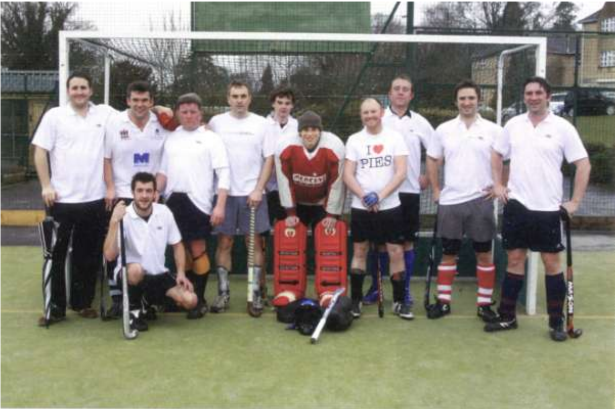
2nd XI ORs

Report to follow in next year's newsletter