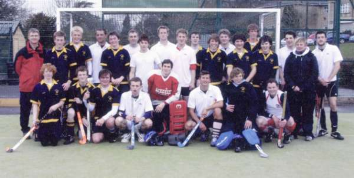
1st XI ORs