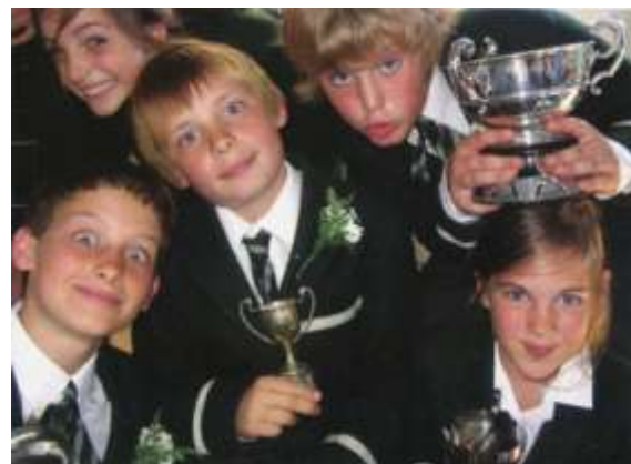
Some of the Rockport Junior Choir at a concert with their prizes!

The money kindly donated by the Old Rendcombian Society has enabled me to travel to and from Ireland, bringing sports equipment and much needed warm clothing, and allowing me to escape from school from time to time! I am also keen for leavers from this year to follow me to Ireland, as this link between Rockport and Rendcomb will hopefully become more established and grow stronger. Although returning to school can seem weird, and being on the teaching side is a bizarre change from being a student, it is great fun and I have met some lovely people. Again, this was all due to the money donated by the OR Society and I am truly very grateful.