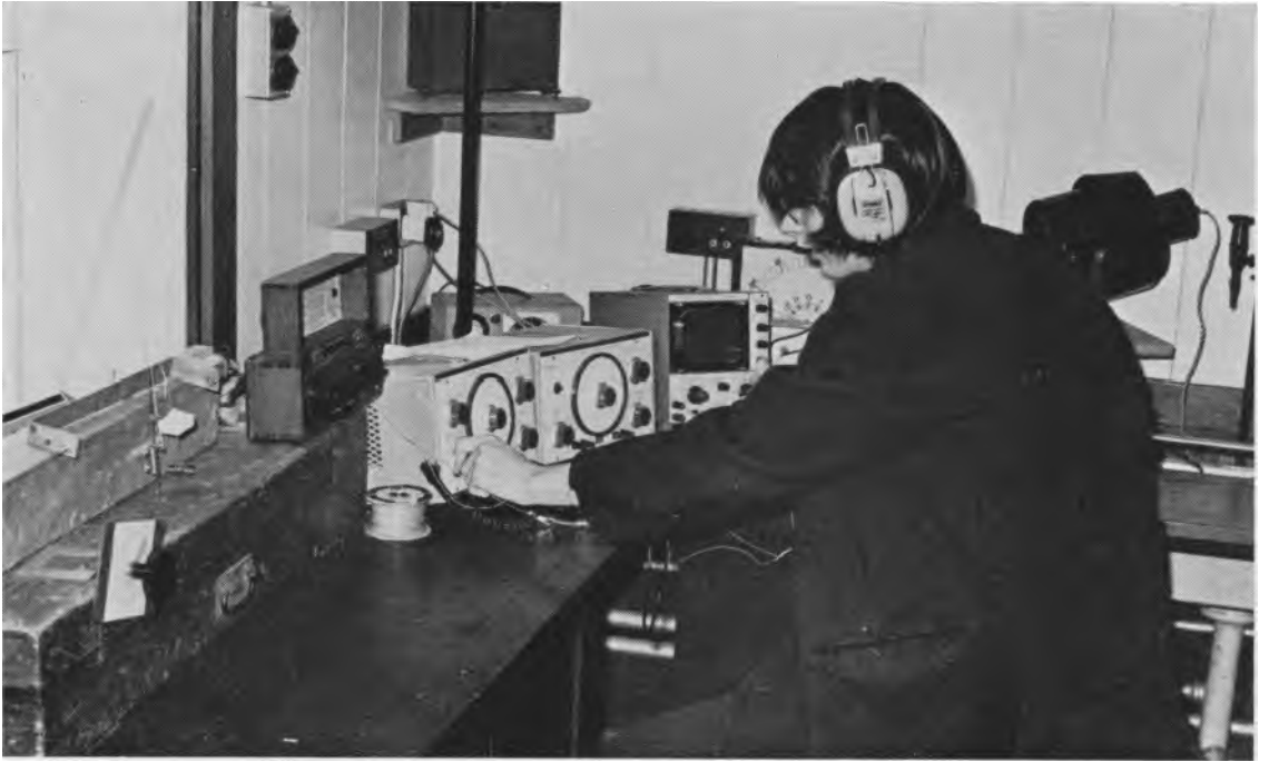
Brains and Beauty: I