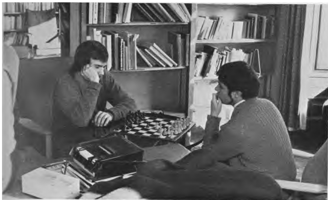
Brains . . . and Beauty: II