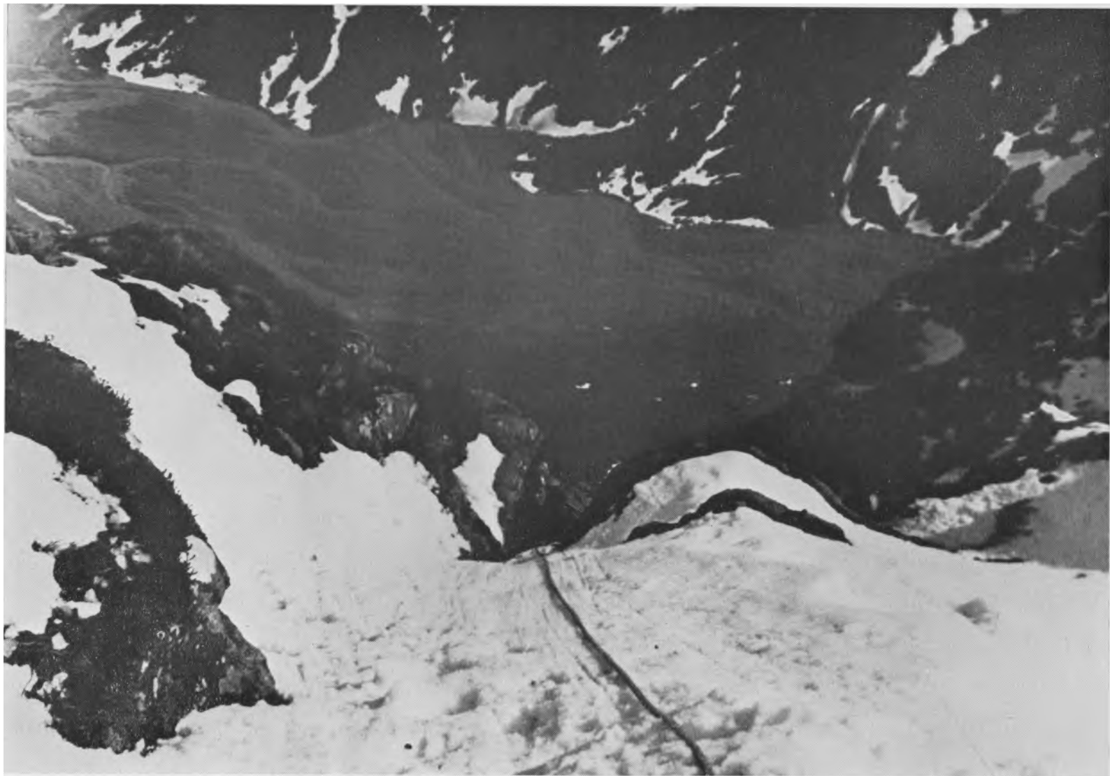
Climbing above the Lost Valley