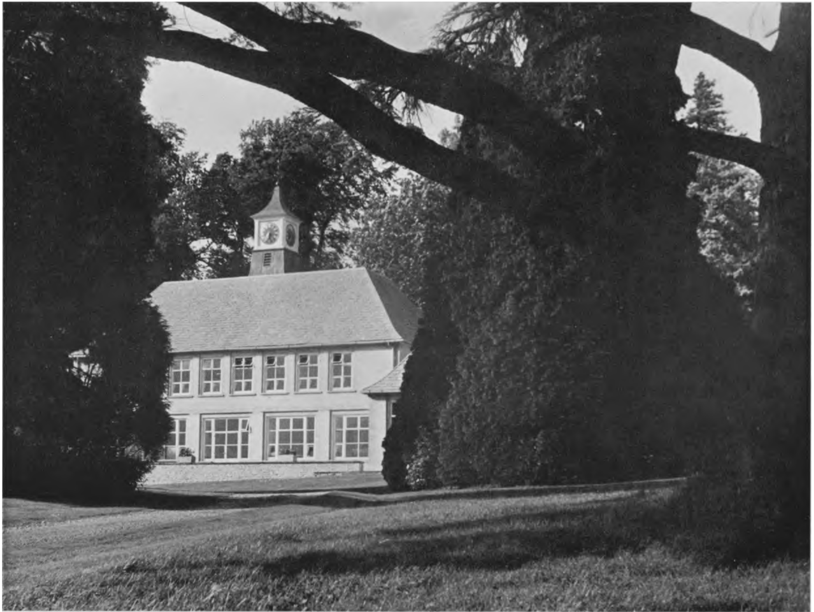
The Arts Block