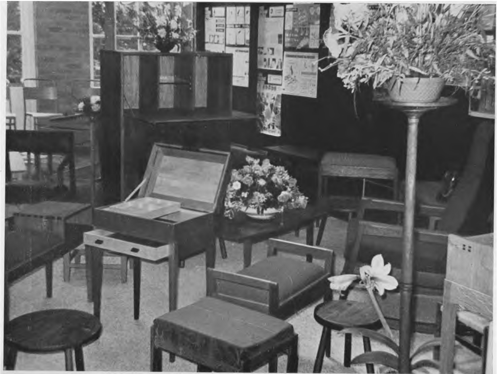
The Woodwork Exhibition