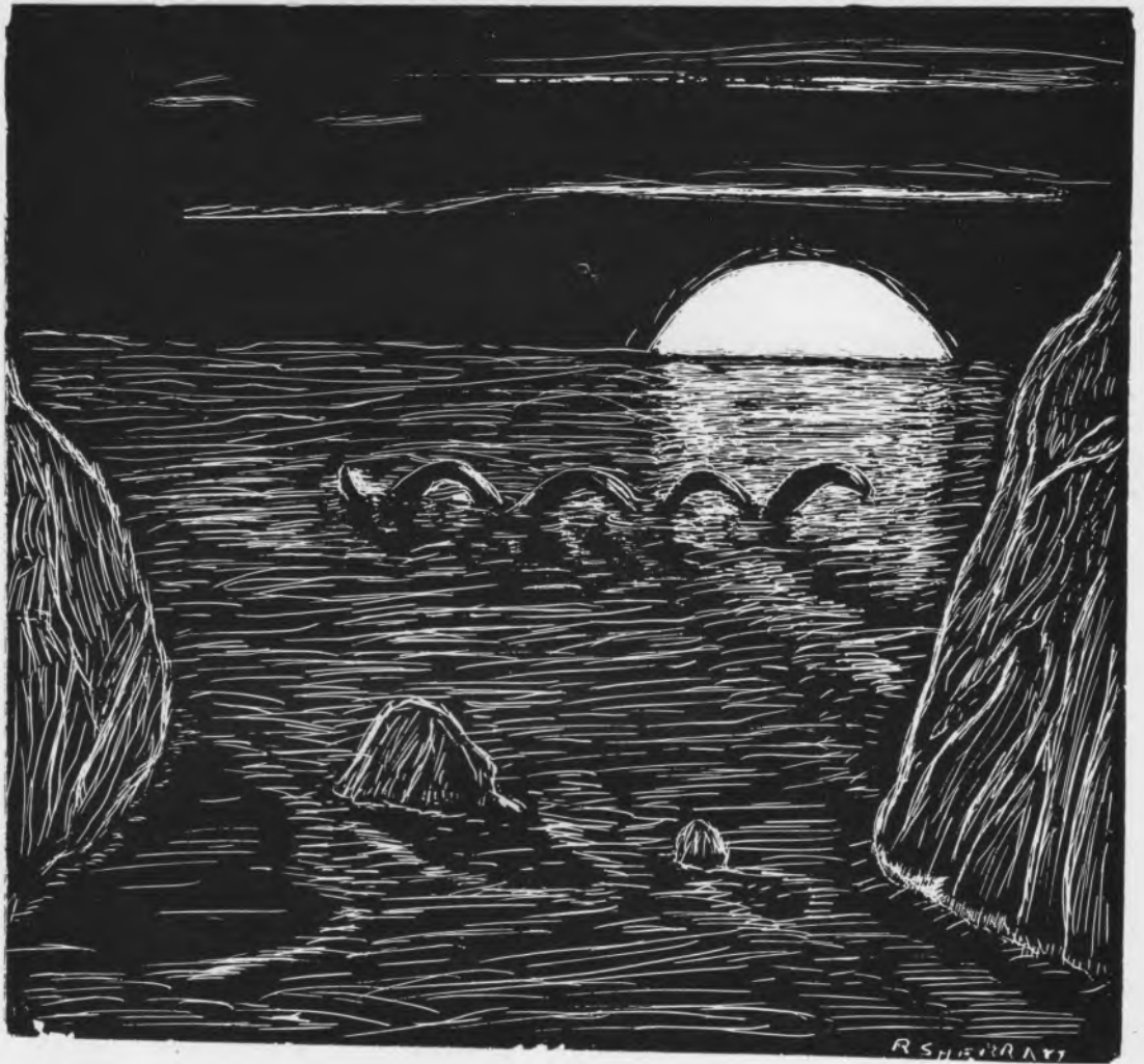
Loch Ness Monster