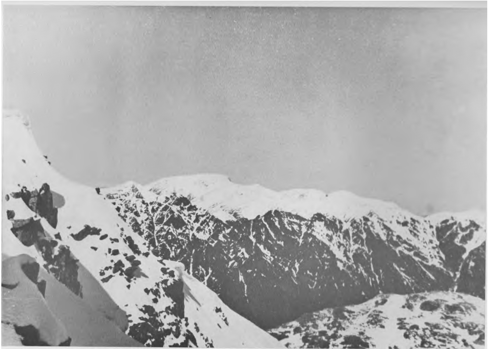
Ben Nevis and North Glencoe