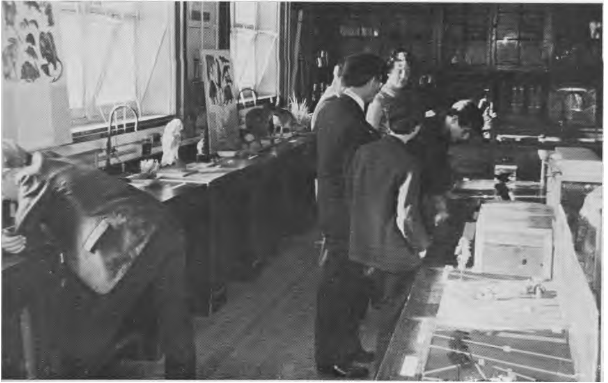
Part of the Science Exhibition