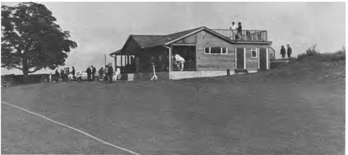
The new pavilion in action