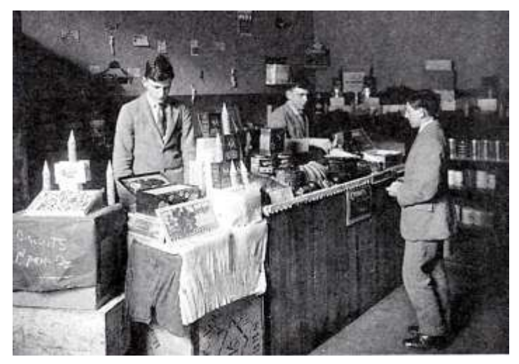
Tuck Shop in 20's / 30's

cycle shed's pitched roof can still be seen on the stonework of the main building.) It is not known when and where the school tuck shop commenced operations, but in the mid-1930s it was situated in the passage leading past the kitchen hatchway towards what is now part of the junior school. It was in the room opposite the former drying room, which is at present the computer network manager's office. The shop sold various kinds of useful articles besides chocolate bars and sweets, such as writing paper, envelopes, pencils, stamps, football boot and cricket shoe studs, and so on. In 1938 it was moved to a small room adjoining the outer courtyard, in the passageway containing the "outside" bell and the main electric