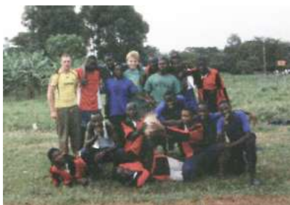
The rugby team