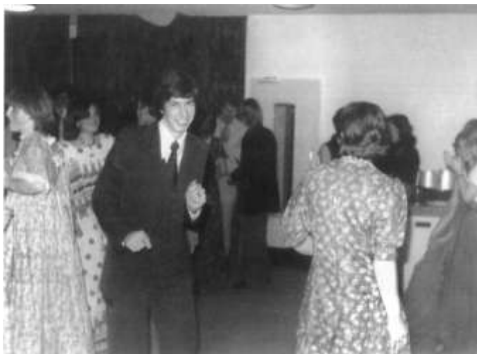
Park House party 1977