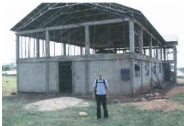
In front of the new dormitory