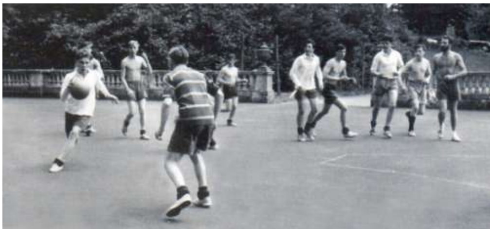
Before the Arts Block

Altogether it is easy to see why the Rendcomb years have left me with a delight in the natural world, and a continuing need for freedom and space in which to enjoy it.