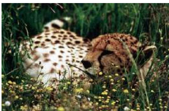
Cheetah relaxing on the plains