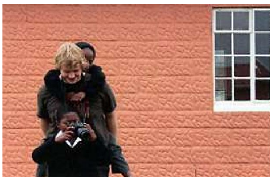
Teaching the children skills required to be a photographer

Ed Slark (2001-11) writes: In October 2011 I visited South Africa. Initially I was stranded in Cairo Airport for 30 hours due to a strike where an angry Arabic mob was tearing through duty free... not a good start.