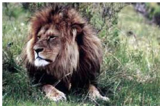
Lion after a kill