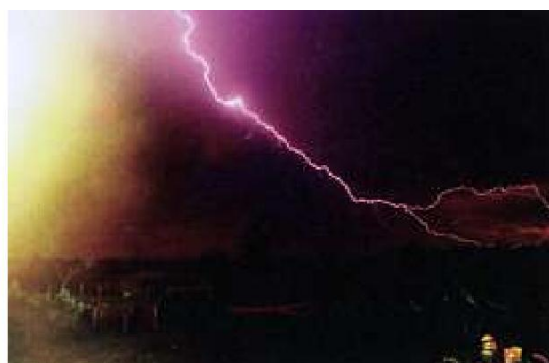
Lightning over Kwantu