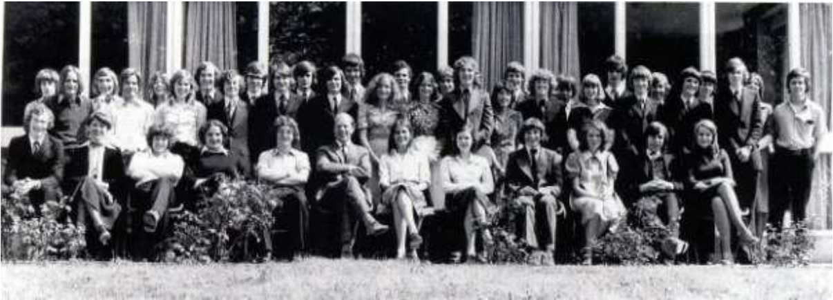
Then and now....