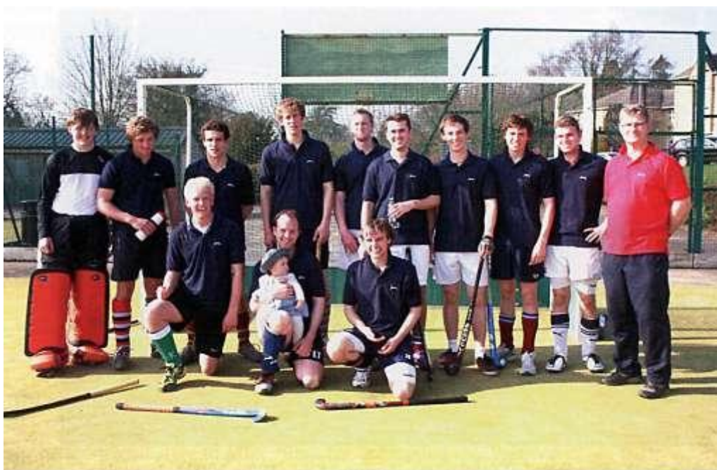
1st XI ORs