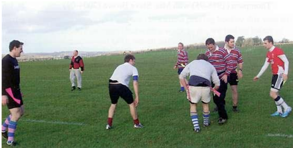
Tag rugby, a precursor for this year's event was played last December and very much enjoyed. Note the pink and yellow velcro tags