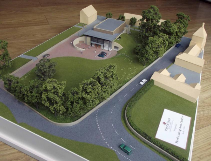
Model of the Performing Arts Centre