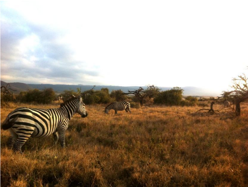
Zebras grazing on the savannah at sunset