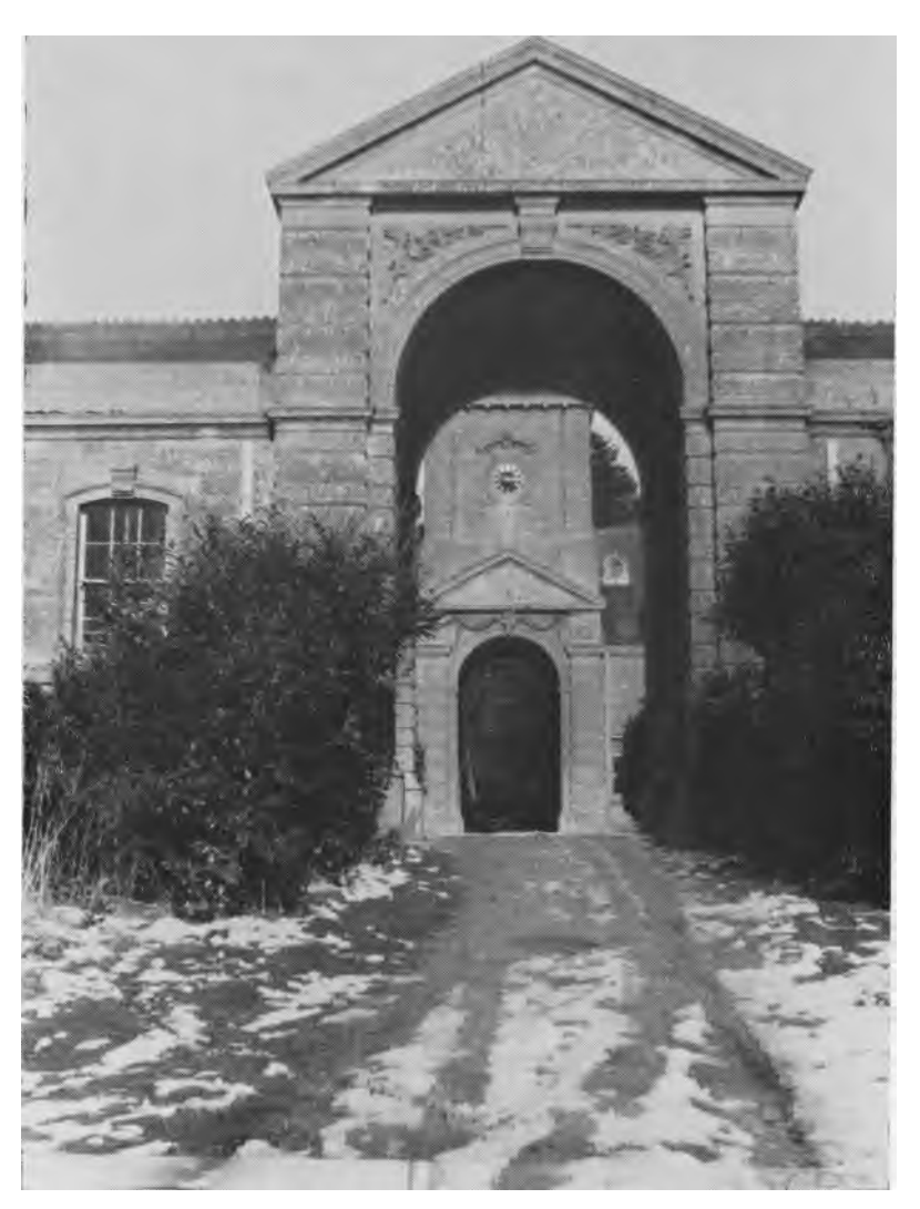
"The very dead of winter" — III