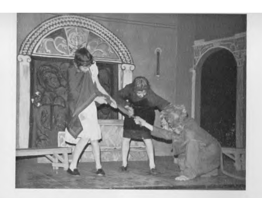
"Androcles and the Lion"