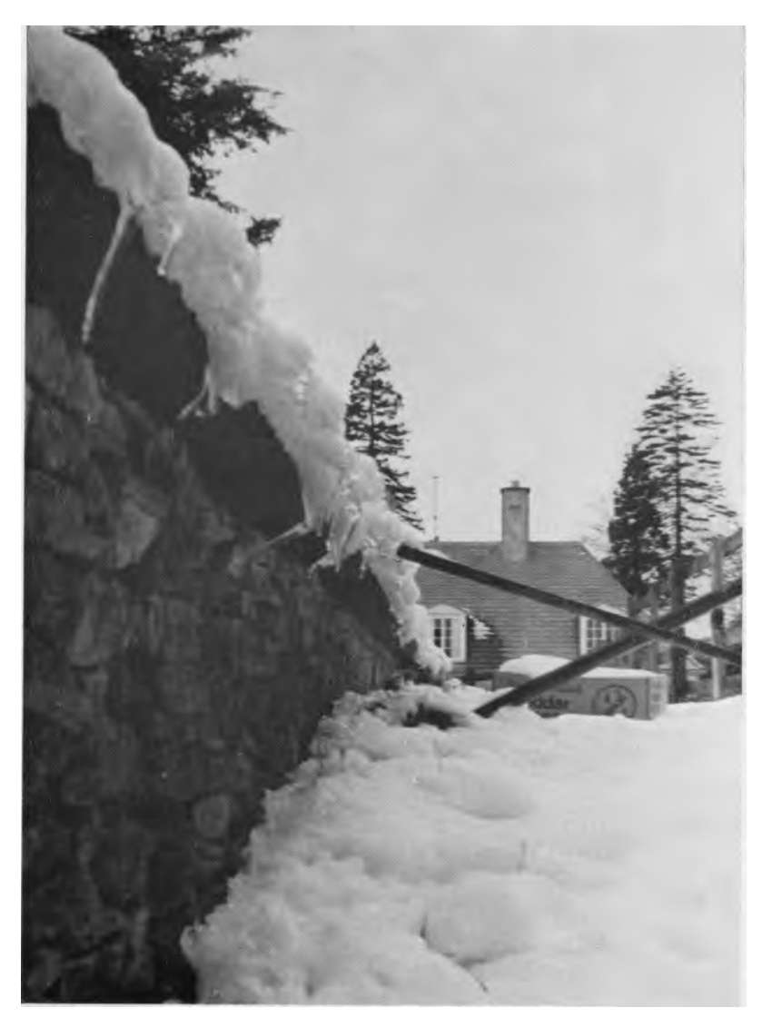
"The very dead of winter" — II