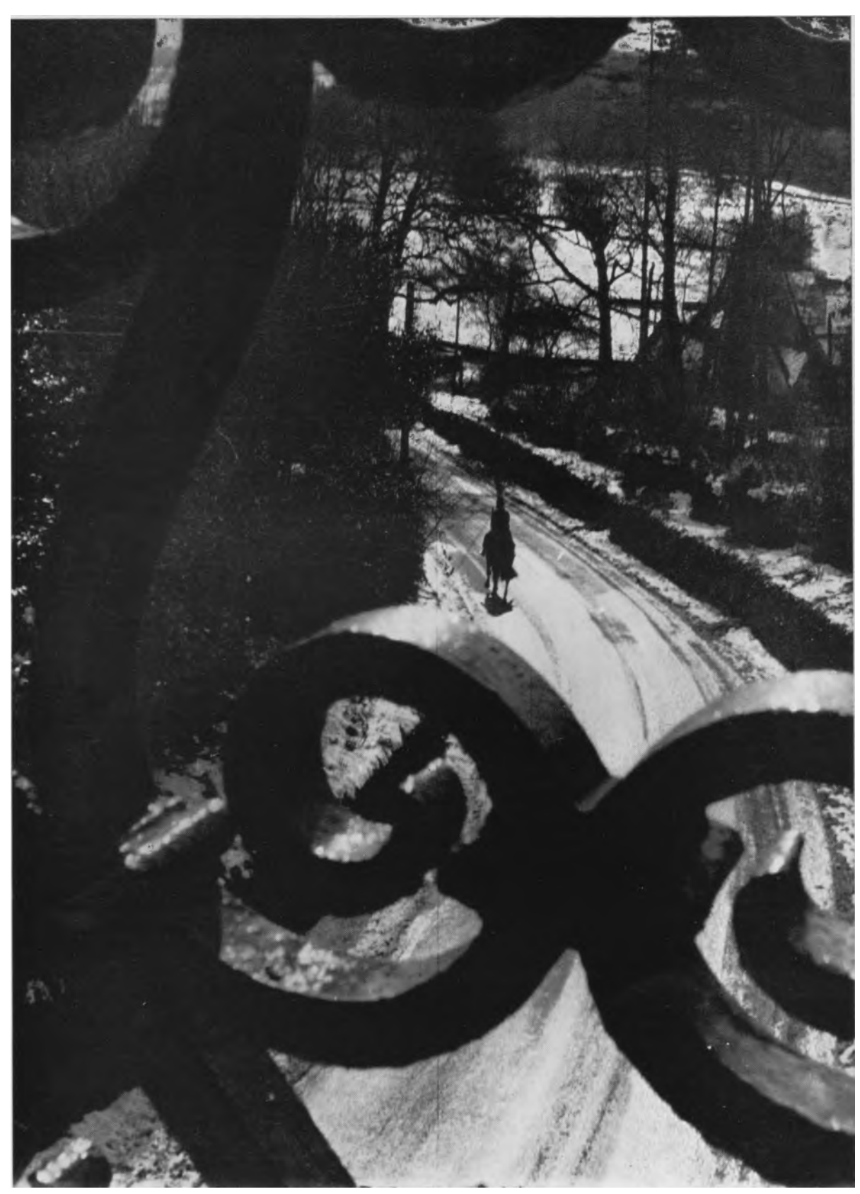
"The very dead of winter" — I