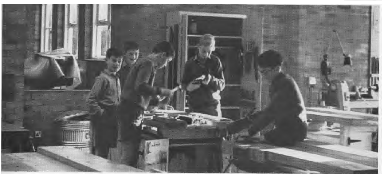
Above: The Woodwork Shop.