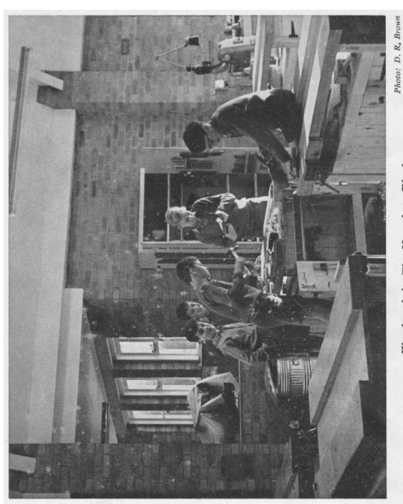
Woodwork in The New Arts Block