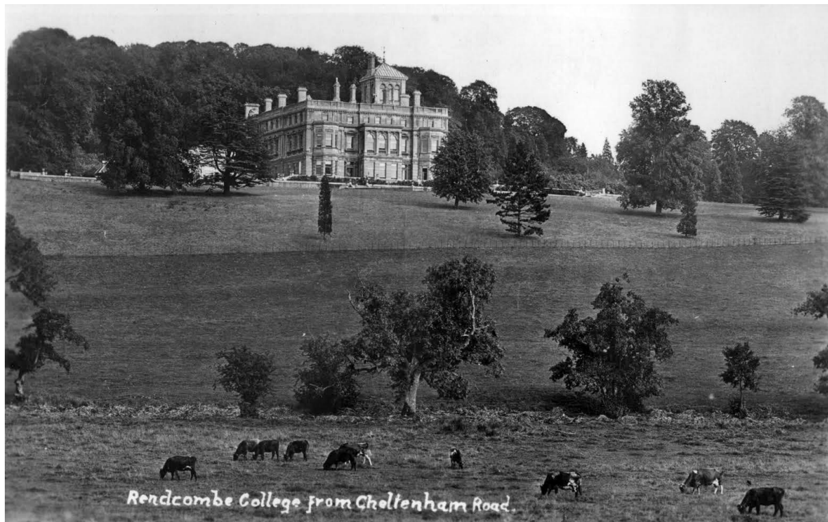
A postcard from the '30s which but shows the College as my parents and their children (three - I was the middle one) remembered it.