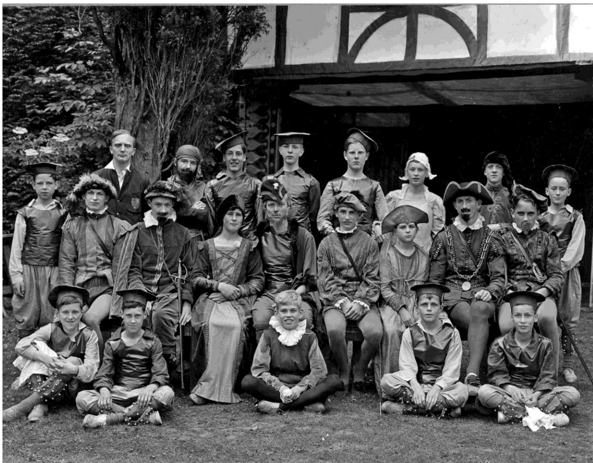
The Shoemaker's Apprentice Founder's Day 1931. My mother designed and made the costumes for most of the plays during her time at Rendcomb. Location was the terraces above the College and I take my hat off to the prop department!