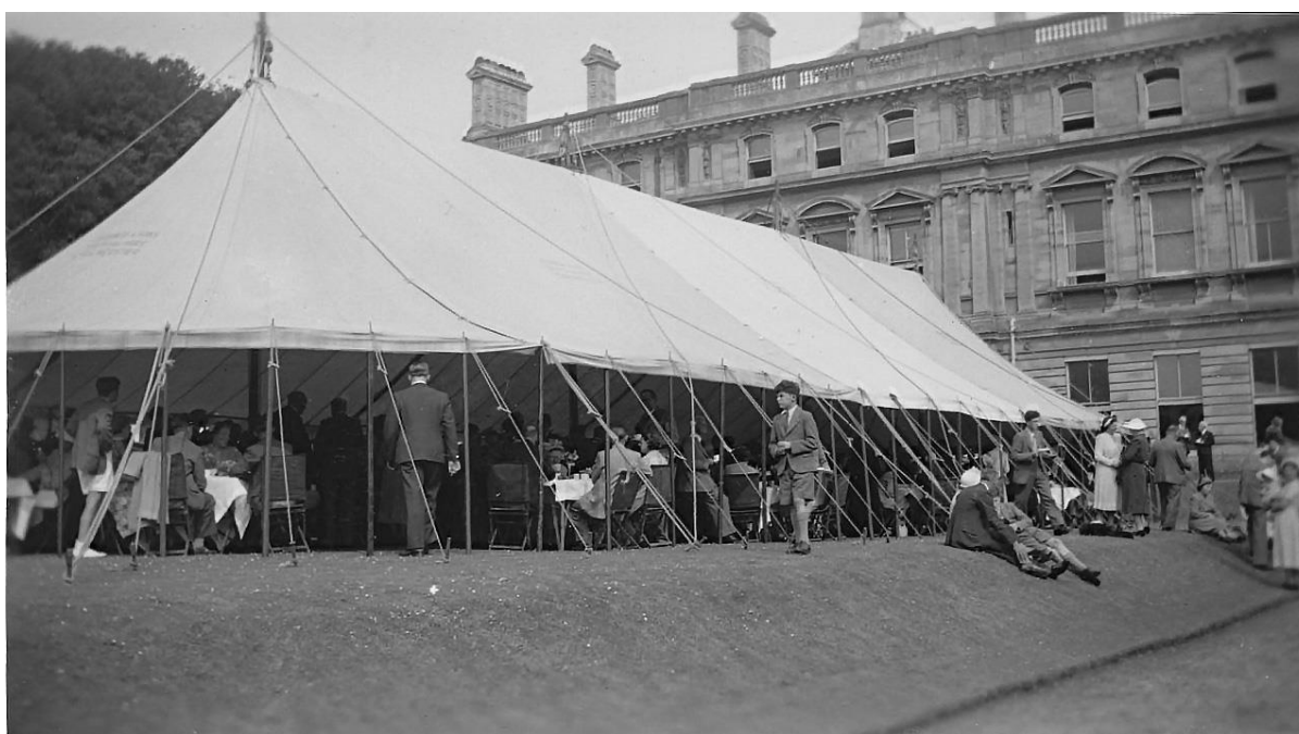
Founder's Day Tea in the marquee in 1951.