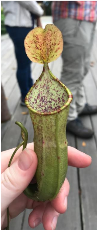
A pitcher plant.