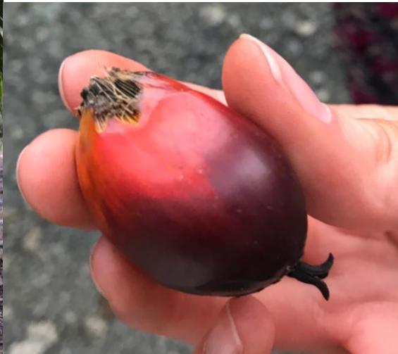
Walking through a palm oil plantation, (left). Holding a palm oil berry (right).

On the 26th was my first morning in the jungle; as soon as I stepped outside the humidity hit me like a wave and I was certainly 'glowing'. We went for a rainforest walk where we were shown buttress roots, aerial roots, seeds and tiger leeches!