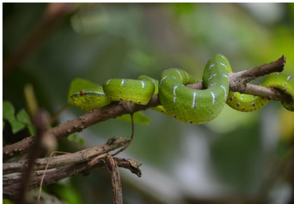
Green Pit Viper.