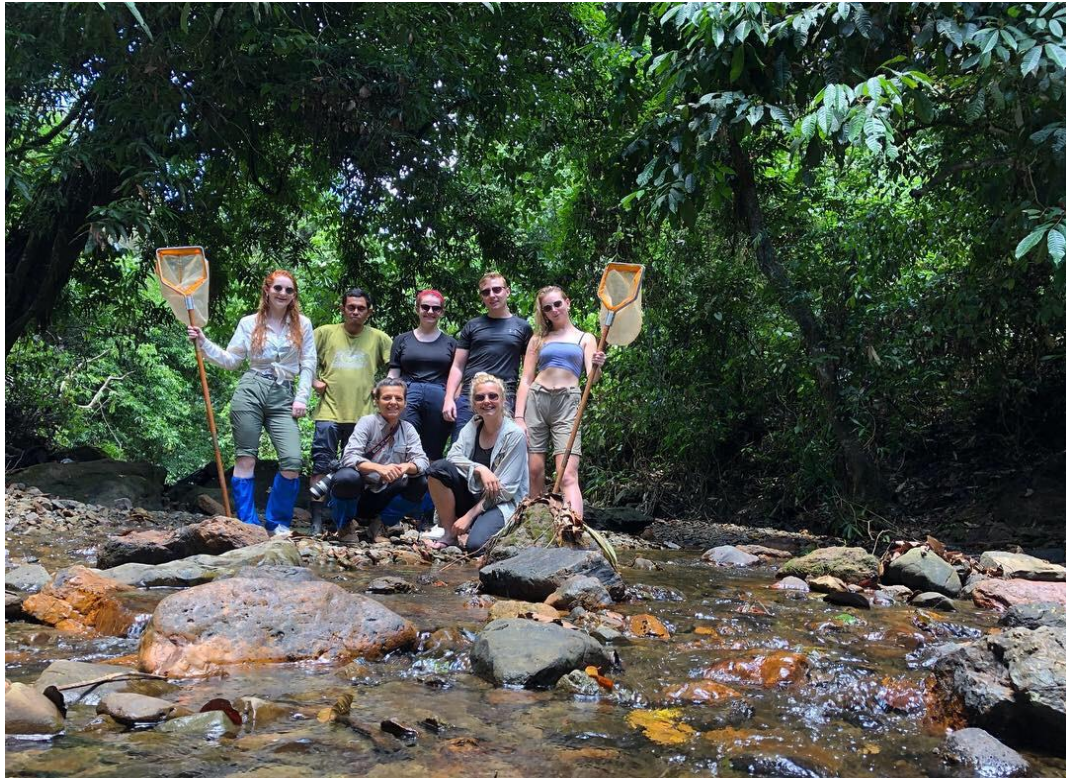
Our Two-Day Project group, I am on the back left, at the Tambun River.

On the second day of the Two-Day Project we saw Red Leaf monkeys and a family of gibbons on the way to our Two Day project site. That afternoon we presented to the group our hypotheses, methodology, main findings and predicted analysis.