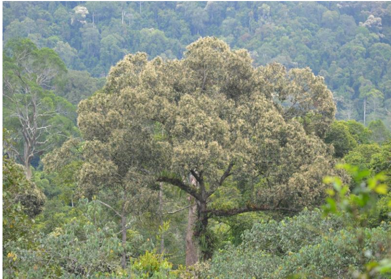
Mass Flowering in a dipterocarp.