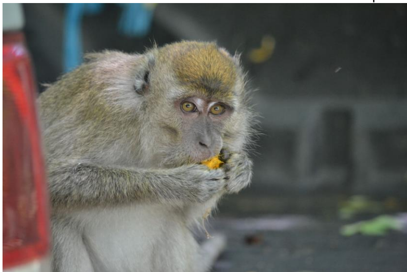
A long tail macaque.