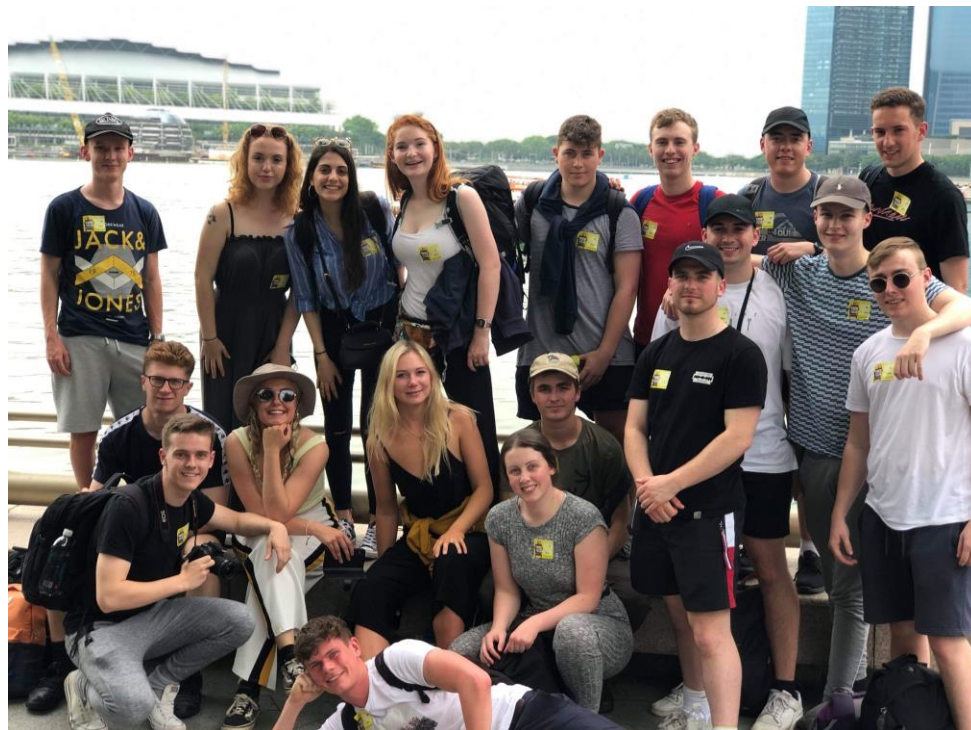
Our group at Singapore, I am on the back row fourth from the left.

Later that evening we began our eventful drive to Danum Valley. Not only did three out of the four transfer vans get a burst tyre meaning we had to stop in the darkness with just the noises of the rainforest surrounding us - nothing like full immersion into something to make you get comfortable! We stopped at a palm oil plantation and got to see the impact on land erosion and hold a palm oil berry. Along the drive we got to see a python, frog- faced owl, moon rat, deer and centipedes.