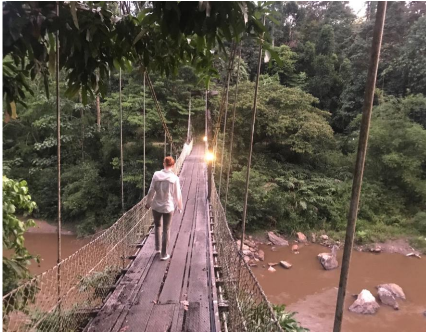
Walking across the bridge in Danum Valley over the Segama River.